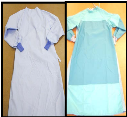
Figure 3: Compel (left) and Gore-Tex (right) reusable gowns

comfort is a critical product requirement. Although comfort is somewhat dependent on the permeability and flexibility of the fabric, there is a design influence (T-PACC, 1997).