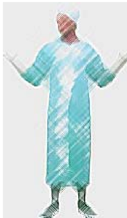
Figure 2: Modern Surgical Apparel