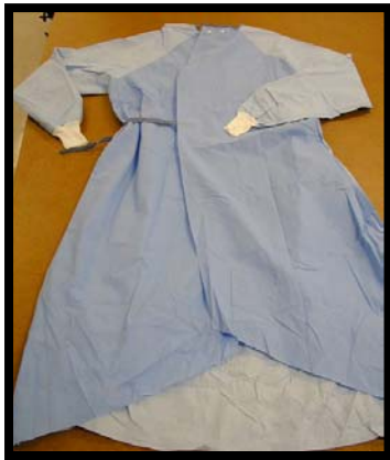
Figure 4: MicroCool Specialty Gown

Most of the gowns were partially assembled using traditional stitches and seams, commonly a 401 double thread chain stitch with a simple superimposed seam. Exceptions to this generalization included an Allegiance gown and the Compel reusable gown that were assembled using a lapped seam structure and two parallel rows of 401 stitching. A large stitch length was used to minimize puncturing of the fabric and limit interference with the barrier performance. Sleeve seams, critical zones for barrier performance, were typically fused. For improved barrier performance at the seams, one Kimberly-Clark gown was entirely fused at the seams.