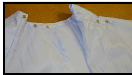
Figure 5: Snap closure

The necklines of the gowns were closed in a variety of ways, all providing some adjustability for fit. Snaps provided one means of closing the gown neckline. The right back panel contained two male snap components. The female components were found near the neckline of the left back panel. Snap components were arranged 1 – 1.5 inches apart to provide four adjustment